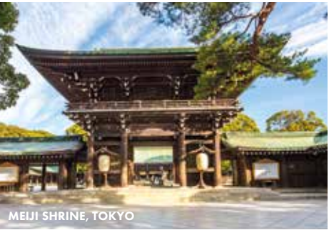
MEIJI SHRINE, TOKYO

Although located in the very heart of Tokyo, Meiji Shrine is surrounded by a dense forest glade. Tokyo’s most renowned Shinto shrine, it is dedicated to Emperor Meiji the Great, who transformed Japan from a feudal state into a world power. The soaring torii gate entry makes quite the statement, as it was constructed with 1,500-year-old cypress. Once inside the elegant shrine, you will likely feel a great sense of serenity. That same sense of tranquillity pervades Hama Rikyu Garden, an Edo-Period garden surrounded by soaring skyscrapers. Chances are, an abundance of flowers will be in bloom, as that is how Hama Rikyu Gardens was designed.