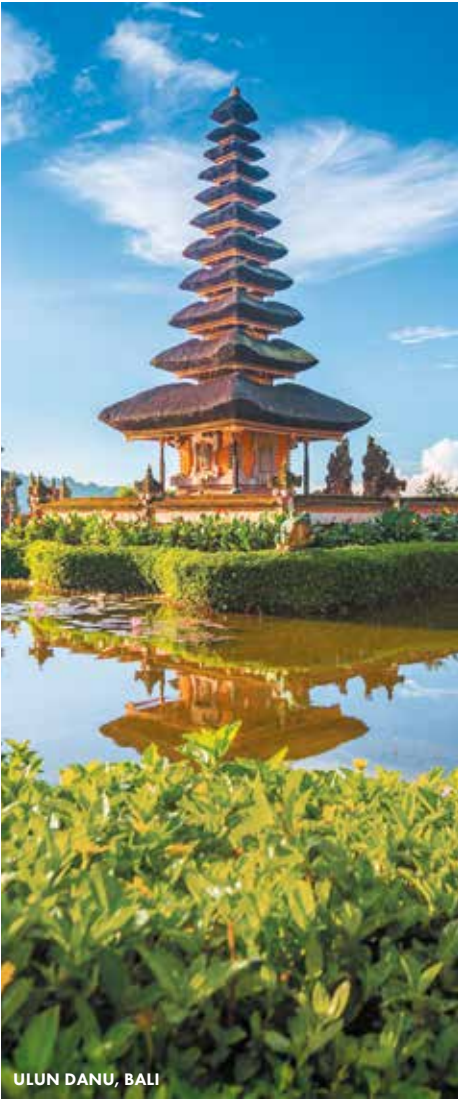
ULUN DANU, BALI