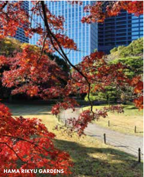
HAMA RIKYU GARDENS